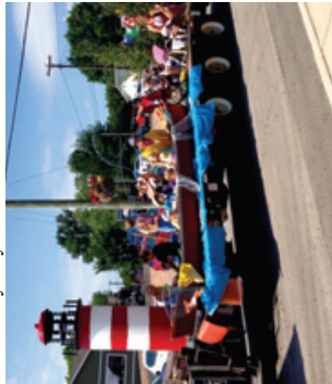
1ST PLACE FLOAT FOR NON-PROFIT WADSWORTH SUMMER STUDENTS JILL HONWICKS-HOPPER, DANIELL COLPITTS AND CLINT STEEVES