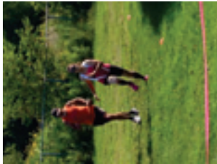
A D L L T S K M B U N