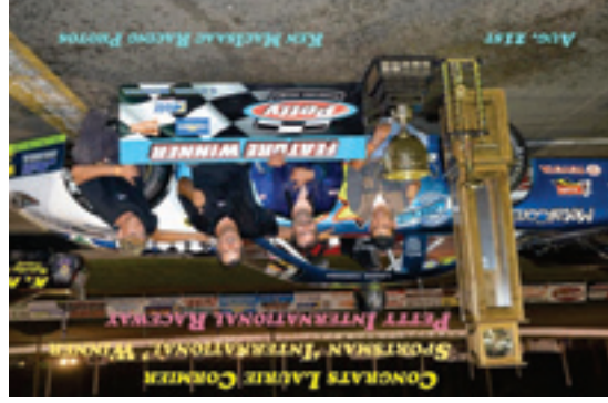
Winners of the International Race Heald at Petty Raceway International August 21st and 22nd, 2015