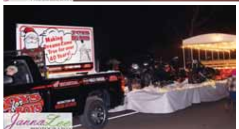
2012 Pettcodiac Festival of Lights Parade pictures