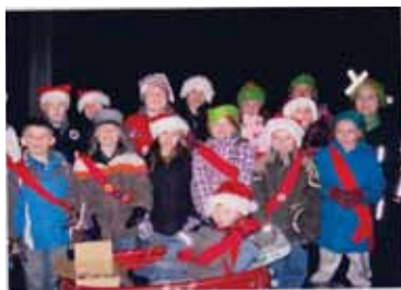
photo of most of the Youth & Juniors who attended the Petitcodiac Parade of Lights on Dec 7 <-----

SJA Division 676 Petitcodiac wishes everyone a very MERRY CHRISTMAS and safe and happy New Year. To the organizers of the events we covered in 2012, thank you, and we look forward to covering your events in 2013.