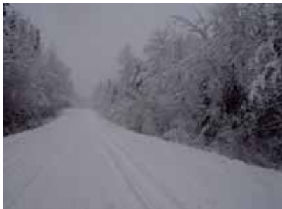
^ picture taken on Little River Road Dec. 19th, 2012