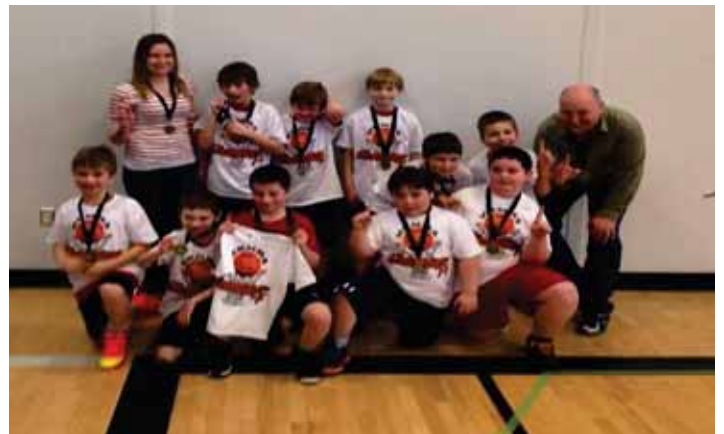
Congratulations to the Salisbury Jr. Minis boys basketball team for winning the gold medal in the Championship game.