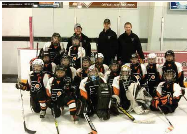
The Petitcodiac / Salisbury Atom Flyers won the silver medal at the home tournament on February 23 at the Petty arena. It was a great weekend of hockey, way to go boys!

Taking Time for Me Weight Group meets every Monday night at the Petitcodiac Baptist Church with weigh in at 6:00 and meet-