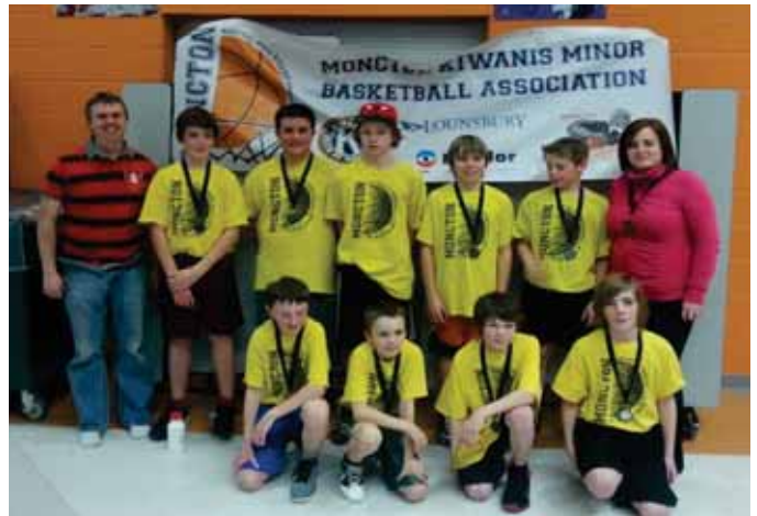
Congratulations to the Petitcodiac MKMBA Bantam Boys for winning the silver in the Finals.