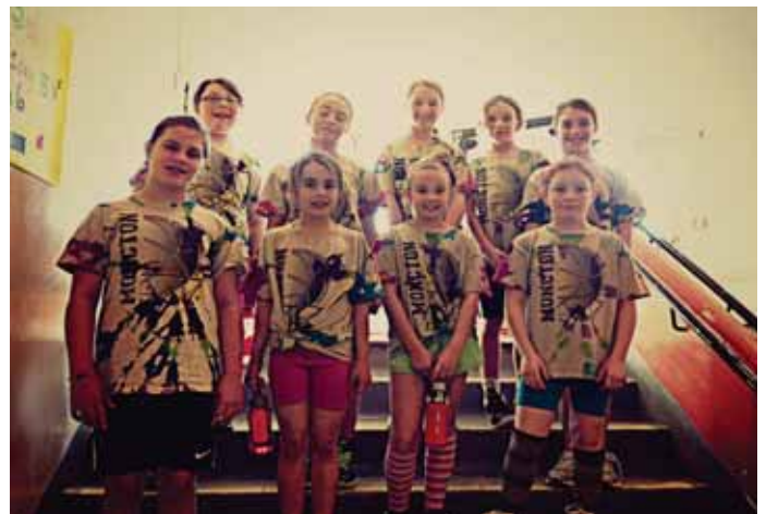
To the Petitcodiac Mini girls you may not have brought home any medals this year but you all played a great season! We are all very proud of the outstanding basket ball you played as a team this year. Great job girls.