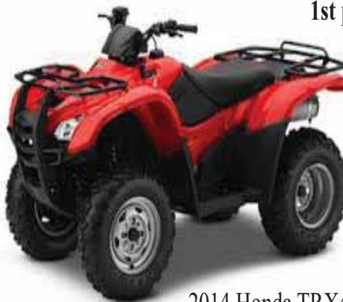
2014 Honda TRX420

Maritime Motorsports Hall Of Fame will be holding their 9th Annual 4-Wheeler Draw tickets on sale now at the office 1 for $100 and 3 for $200