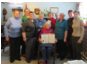
Names from Left to Right are: